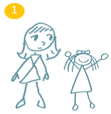
Households with at least one adult and one child

Adult: anyone 18 years or older Child: anyone 17 years or younger